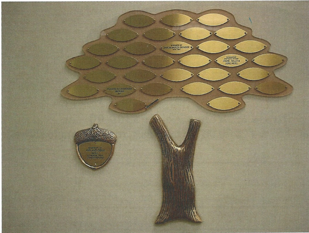
Tree of Life